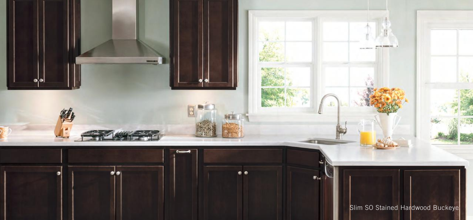
Slim SO Stained Hardwood Buckeye

Styles, product availability and construction may vary slightly from those shown in this book due to material availability and/or design evolution. Specifications are subject to change without notice. Customer service is available if your design requires verification of product availability and specifications.