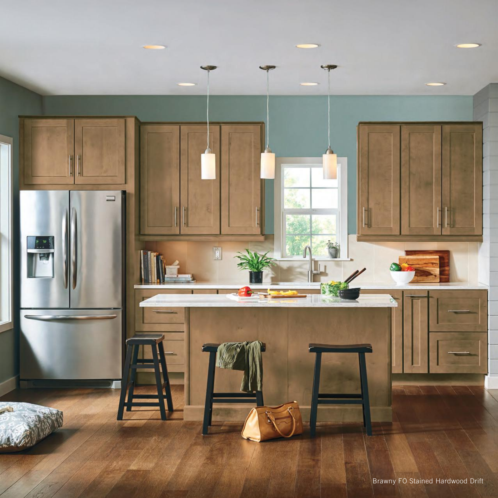
Brawny FO Stained Hardwood Drift